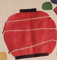
basic Tet decoration